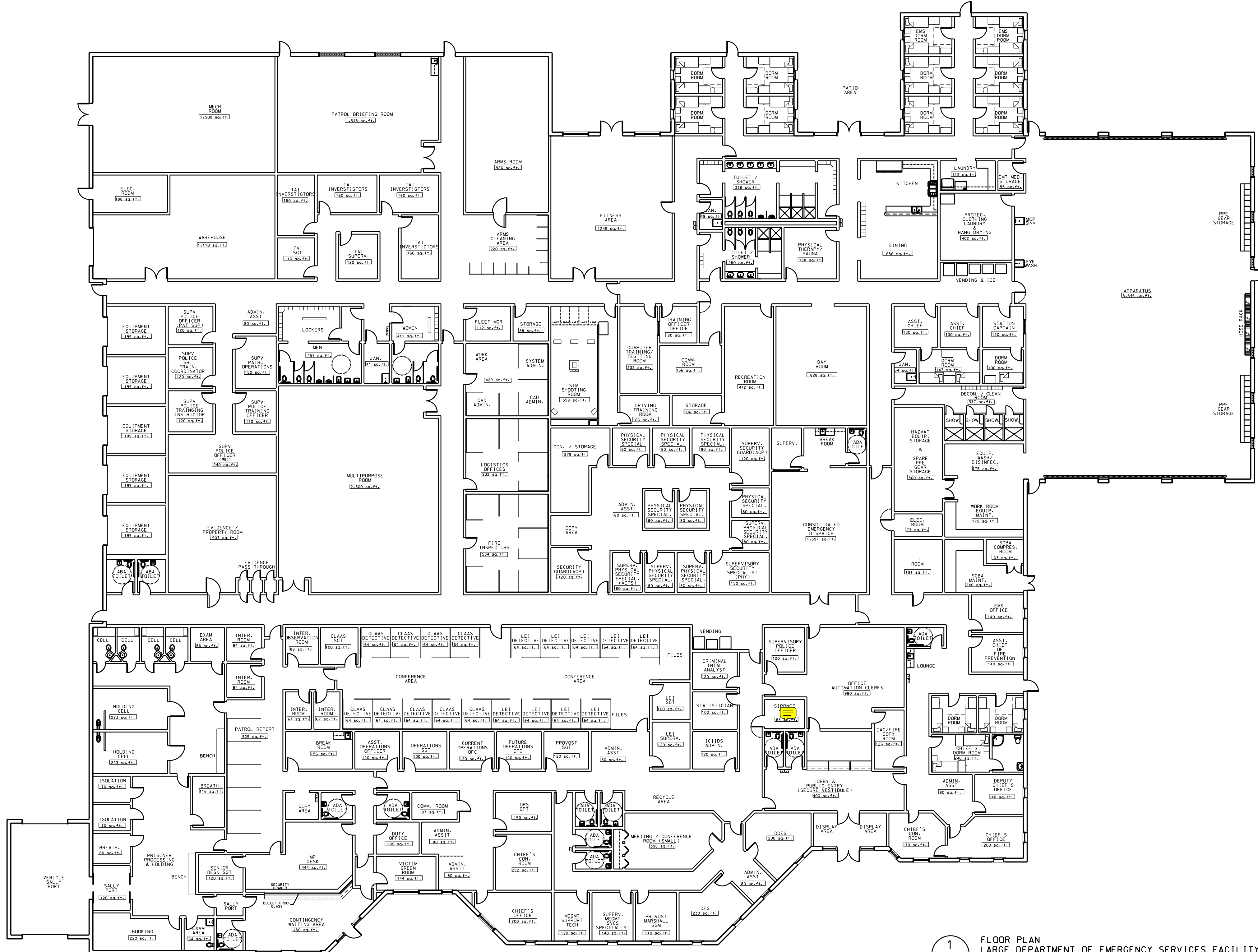
1 FLOOR PLAN XXXX LARGE DEPARTMENT OF EMERGENCY SERVICES FACILITY SCALE: 1' - 0" = 1/16" 63,400 SQ. FT.