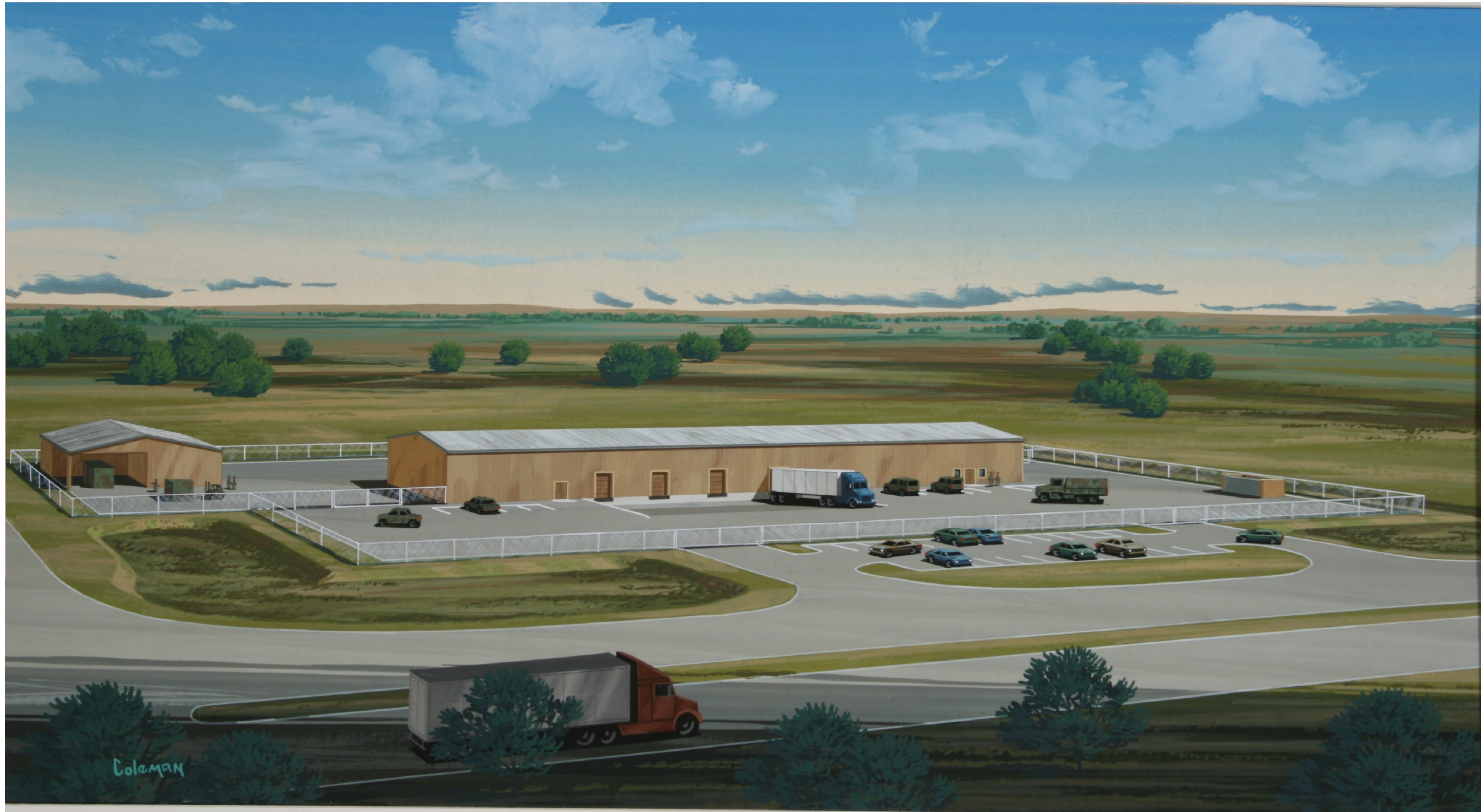
1 AIT 3-STORY BCOF COMPLEX EXTERIOR PERSPECTIVE SCALE: N.T.S.

NOTE: FINISHES AS SHOW, ARE SITE SPECIFIC AND WILL VARY FROM ONE INSTALLATION TO THE OTHER. FINISHES TO BE COMPATIBLE WITH THE INSTALLATION'S ARCHITECTURAL THEME.