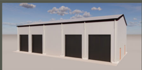
Single Story Metal Frame

Tactical Earthen Rapidly Raised Assembly Hut