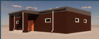
Single story constructed with onsite soil

Tactical Earthen Rapidly Raised Assembly Hut