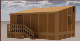
Single story, panelized, modular facility