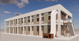
Single or Two story structure with integral ballistic protection