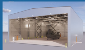
Metal Hangar or Warehouse Space