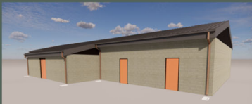
Single story CMU envelope with direct fire protection