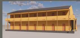
Single or Two story wood structure